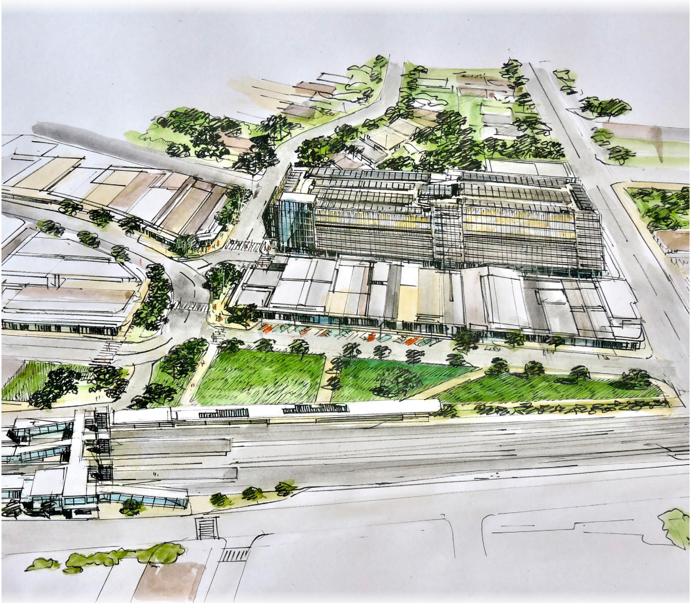
Artist's impression of Revesby commuter car park extension, subject to detailed design

We heard feedback from the community regarding traffic flow in the area. As part of the development of the Review of Environmental Factors, we undertook traffic assessments to understand how nearby streets currently operate and how the additional levels may impact traffic flow. Our studies showed that additional traffic from the car park expansion would have a negligible effect on traffic on nearby streets.