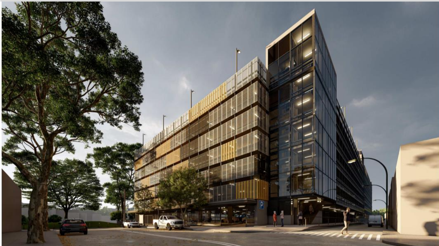
Artist's impression of Revesby Commuter Car Park