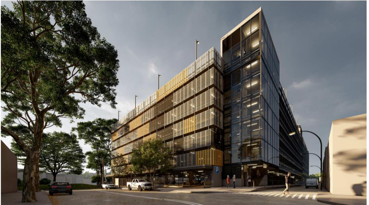
Artist's impression of Revesby Commuter Car Park

Transport for NSW is providing additional commuter parking at Revesby, to provide the community with more convenient access to public transport and reduce congestion on our roads. This project is jointly funded by the Australian and NSW Governments.