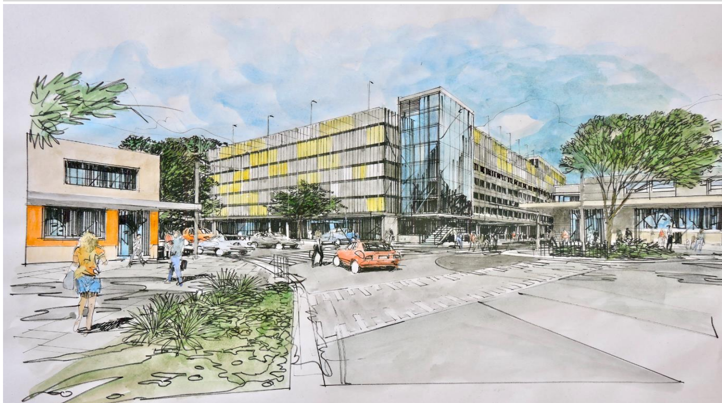
Artist's impression of Revesby Commuter Car Park, subject to detailed design

Transport for NSW is providing additional commuter parking at Revesby, to provide the community with more convenient access to public transport and reduce congestion on our roads. This project is jointly funded by the Australian and NSW Governments.