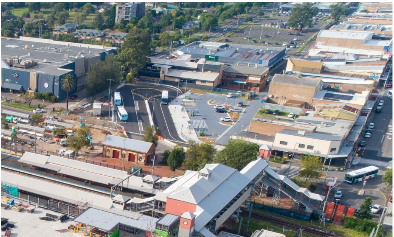
Aerial view of the completed temporary bus interchange at St Marys

The temporary bus interchange, within the former Veness Place car park on Station Street, opened to buses and bus passengers on Monday 7 March 2022 . This will enable construction of Sydney Metro – Western Sydney Airport. Minor works on and around the temporary bus interchange will continue in May.