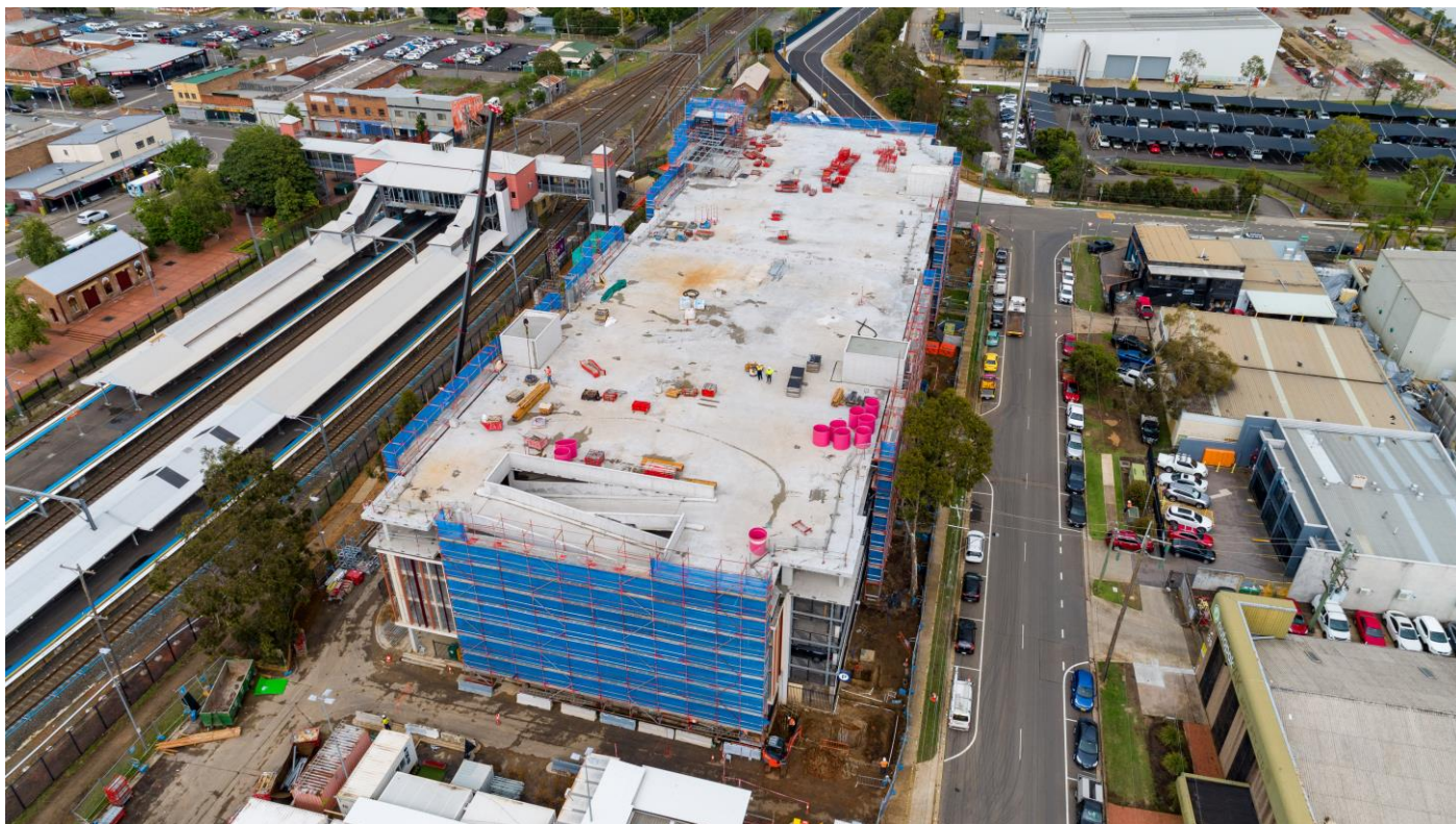
Construction progress on the multi-storey commuter car park at St Marys