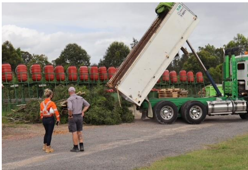
Tree clearing and vegetation removal for donation to Sydney Zoo – January 2022

Thank you to our contacts Tara, Darryn and Frankie for working with us to repurpose removed vegetation. We hope to work with Sydney Zoo and their incredible team again in the near future.