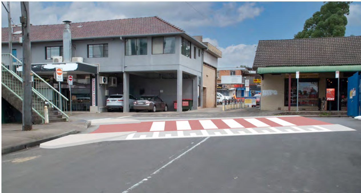
Artist's Impressions of Railway Parade safety improvements, subject to detailed design