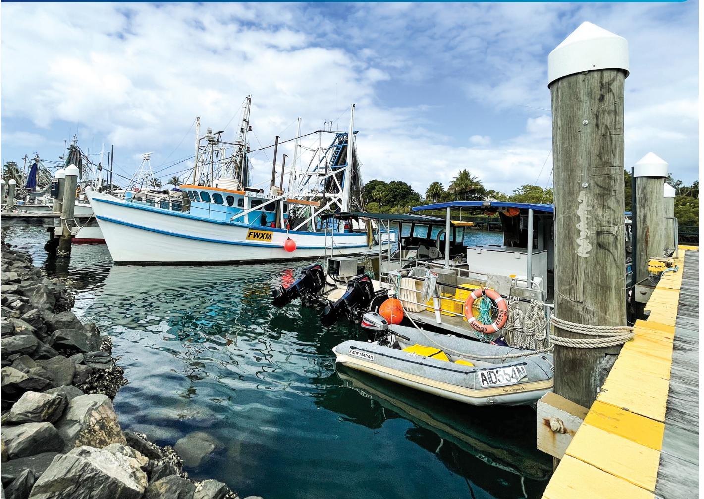
Southern Boat Harbour, Tweed Heads

The NSW Government is delivering major improvements to maritime infrastructure and facilities to help recreational and commercial boaters safely access, use and navigate our rivers and coastal waters, and to benefit communities