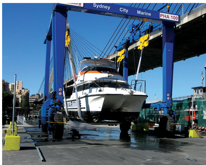
Example of boat travel lift: Image supplied by Sydney City Marine

A boat travel lift is a hoist on wheels that can lift a boat out of the water and relocate the boat within a boat maintenance facility.