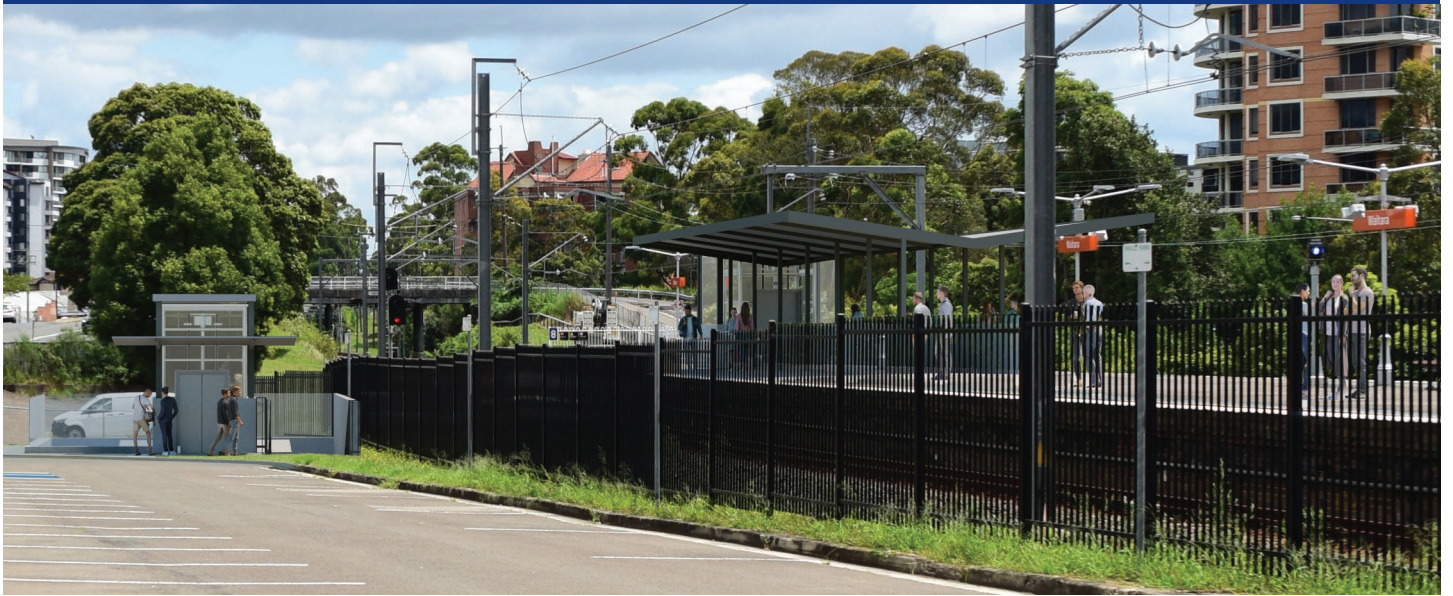
Artist's impression of the proposed upgrade, subject to detailed design