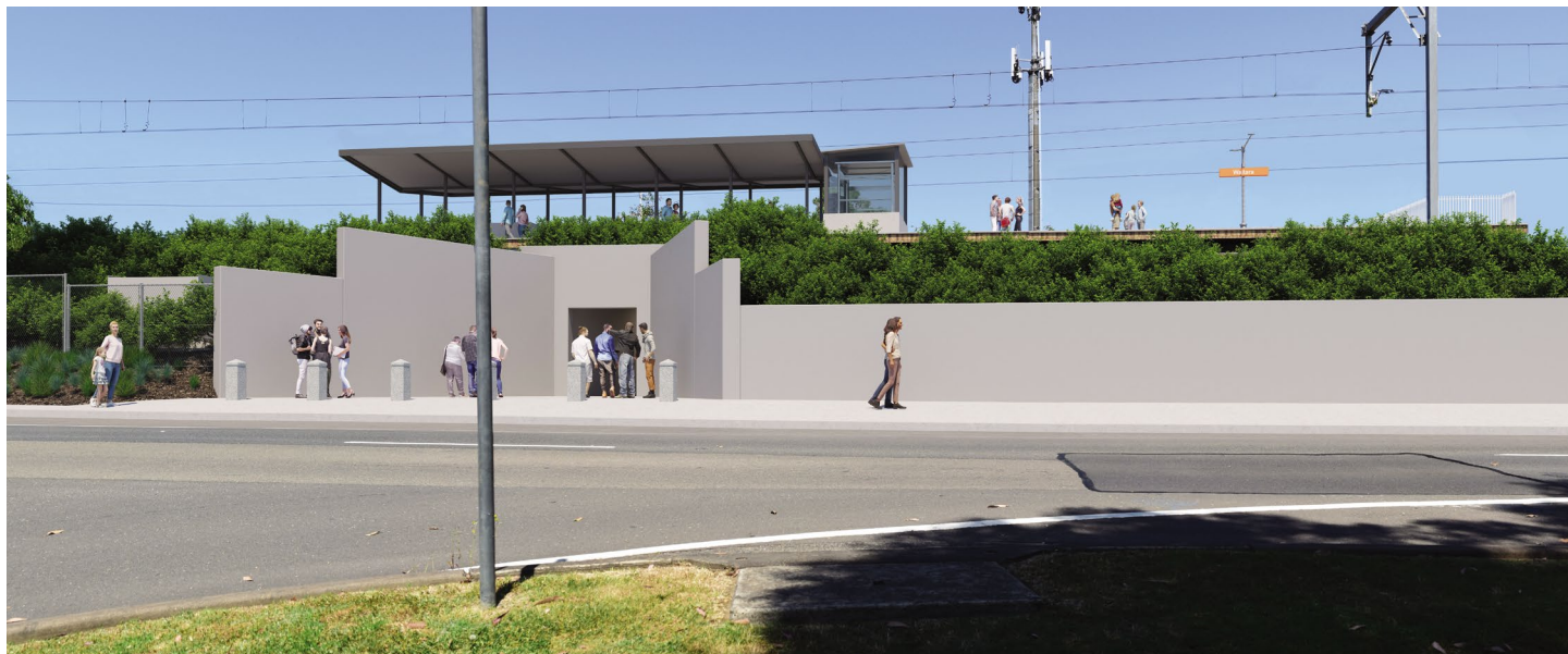
Artist's impression of the proposed upgrade, subject to detailed design