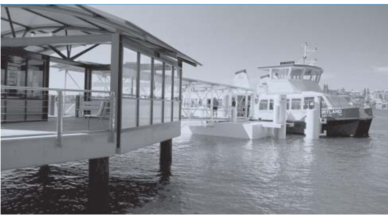
The new Stockton Ferry Wharf has been specifically designed to meet the needs of elderly and disabled commuters