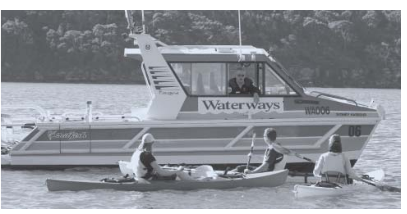
The Waterways Authority provides a valuable service to the community by providing on-water safety advice for all types of recreational craft

The Waterways Authority, through the marina, has continued to support the Superyachts Sydney Alliance, a marketing group initiated by the Authority that includes six leading NSW superyacht industry related companies promoting their skills worldwide.