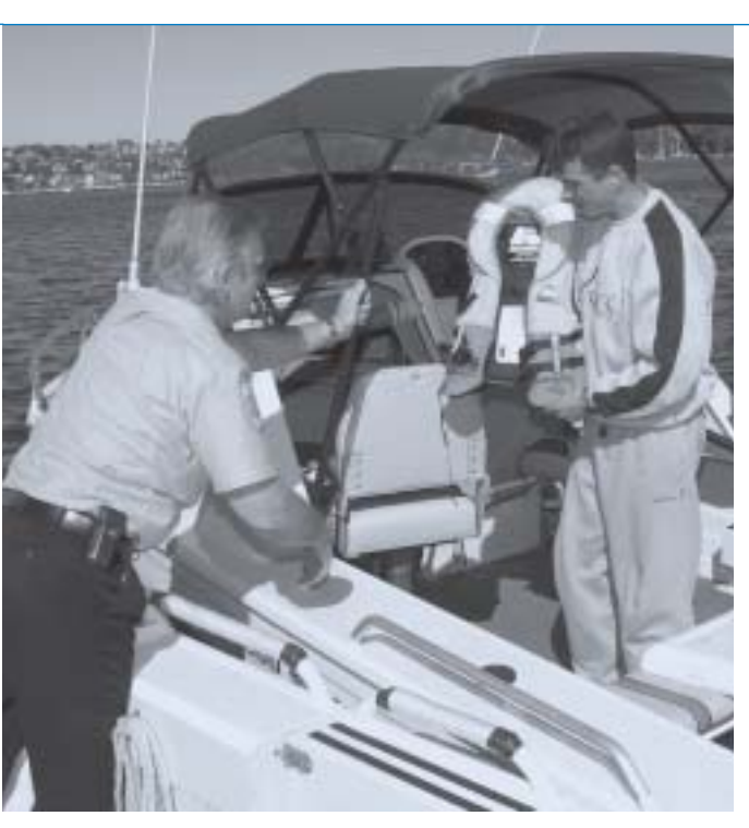
One of the most important messages conveyed on the water during the year was the importance of carrying and wearing lifejackets