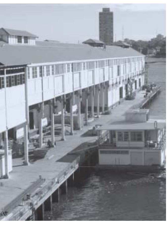
The refurbishment of Walsh Bay Pier 2/3 continued during the year and comprised replacement of worn piles and substructure as well as the roof and wall cladding

In October 2002, the Authority, with the developer, received a 'Highly Commended' development excellence award from the NSW Urban Taskforce for the redevelopment.