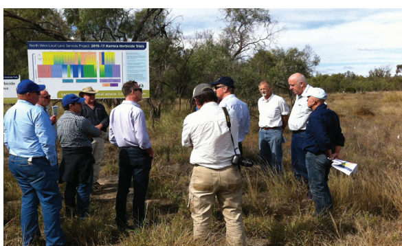
REC members join Northern Region LLS and OEH staff on an inspection of Travelling Stock Reserves near Moree

The REC met four times during 2015-16. Meetings were held at Albury hosted by Murray LLS (10 & 11 August 2015), Office of Environment and Heritage, Sydney (16 November 2015), John Holland Rail, Mayfield (8 February 2016) and Moree Plains Shire Council, Moree (10 & 11 May 2016).