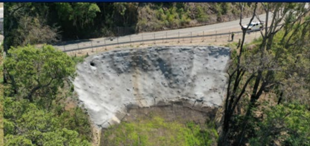
Dewers slip complete