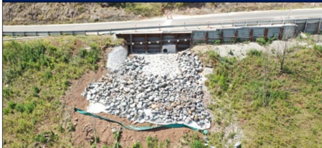
Slip 8 complete