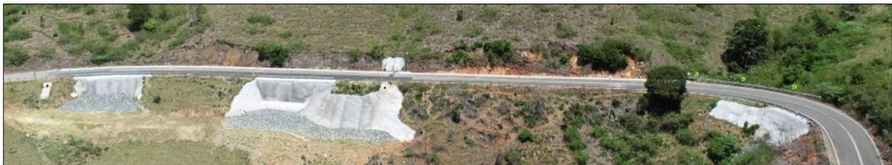
Slip 2 A, B, C and Gabion Corner complete

Work at Slip 2, Slip 8, Gabion Corner and Dewers Slip (stage 1) is now complete. This involved site stabilisation, installing drainage and new safety barriers, replacing culverts and restoring the road pavement.