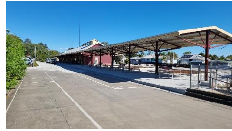
Completed work at Casino station