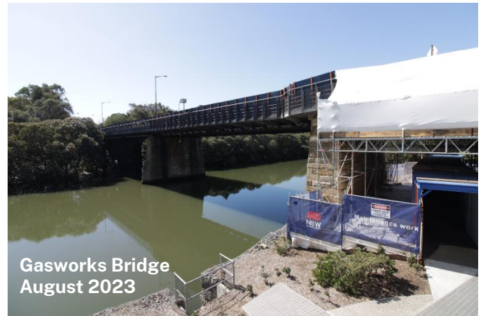
Gasworks Bridge August 2023

The northbound lane of Macarthur Street over Gasworks Bridge will be closed from 8pm, Friday 25 August and will reopen to traffic once the project is complete.