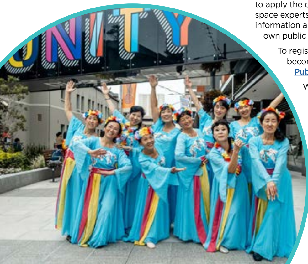
Unity Place, Burwood.

While the department does not intend to subject the charter to regular review, we may update it as required to reflect contemporary practice and emerging research.