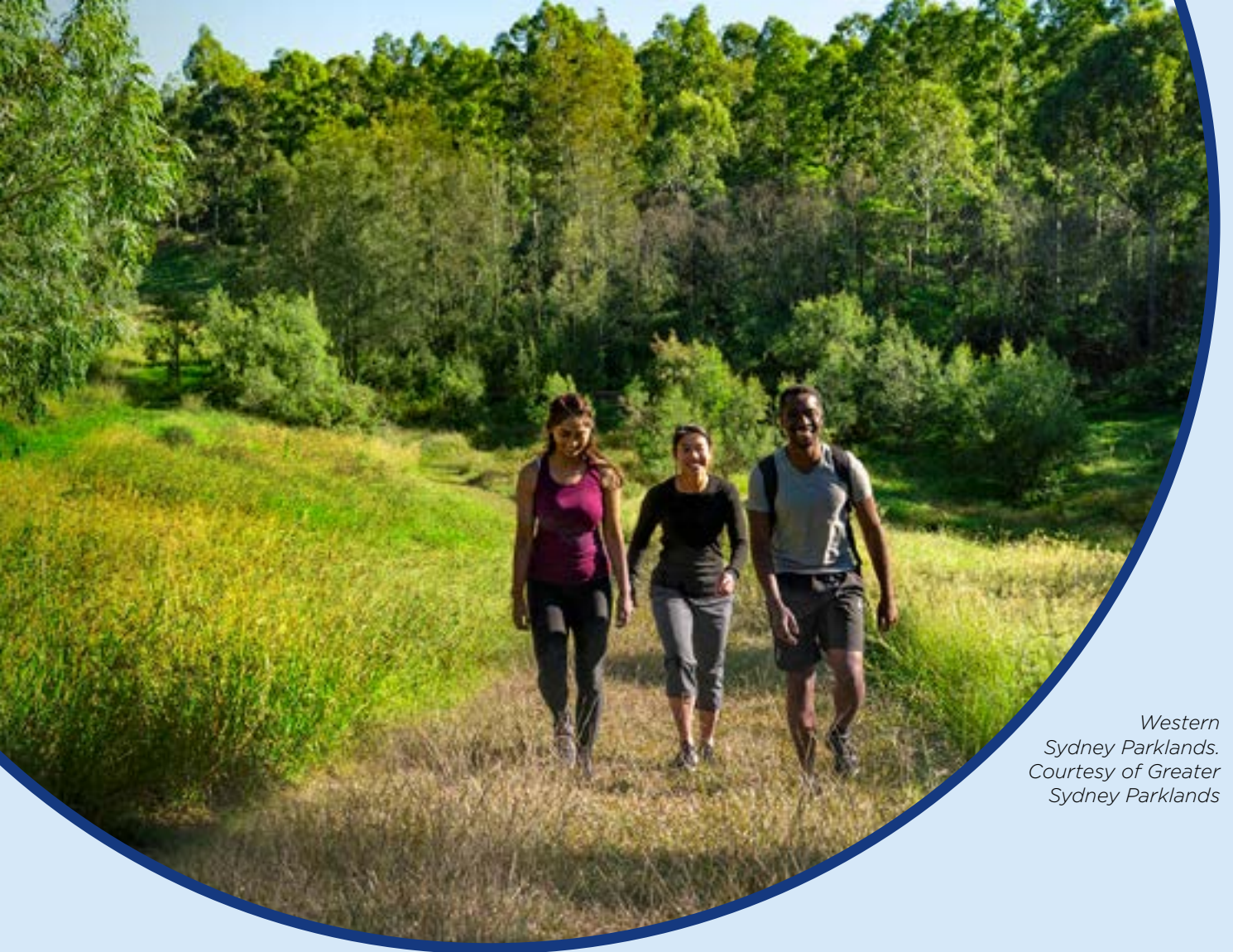
Western Sydney Parklands.