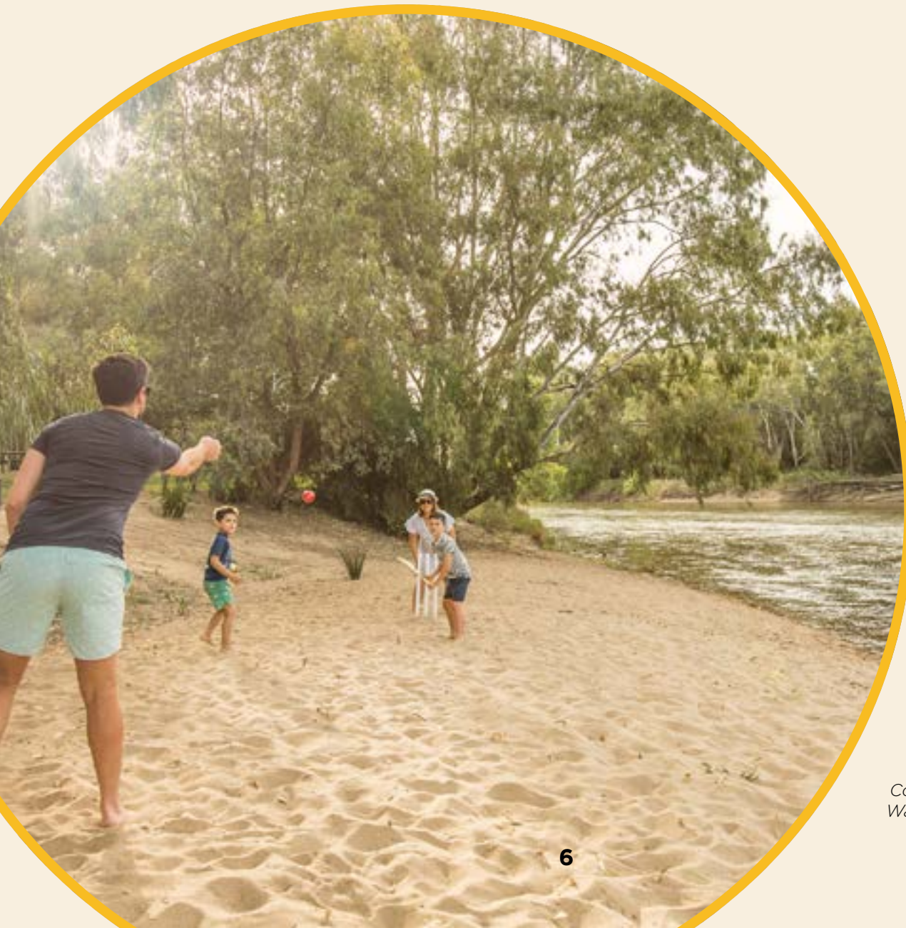
Wagga Beach, Wagga Wagga.

The charter's principles are premised on the understanding that there isn't a one-size-fits-all approach to public space. Every public space has its own unique history, heritage, context and is supporting the different needs and uses of a specific community. There are significant and important differences in landscape, climate, amenity, population density and social and cultural demographics across Greater Sydney and regional and rural New South Wales. All these factors influence where and how people use public space and what the priorities are for their community. There are no set rules as to where and how the charter applies – it could apply to the management of a national or regional scale parkland, just as it could to the design of a new pocket park.