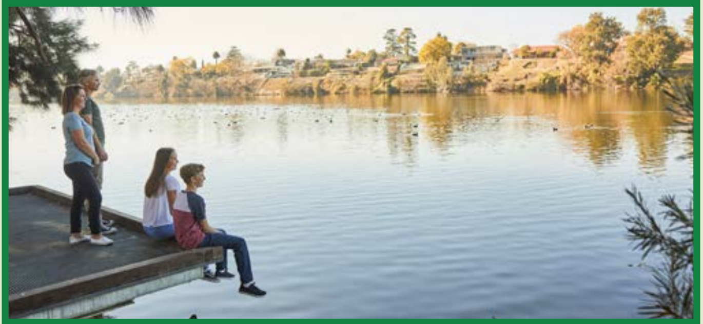
Great River Walk, Penrith.

Public space connects us to nature, enhances biodiversity and builds climate resilience into communities.