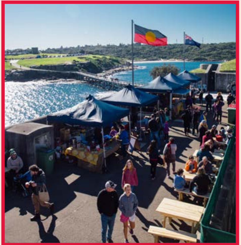
Blak Markets, La Perouse.

Using streets as public spaces can create more vibrant and dynamic retail and hospitality precincts and attract higher foot traffic. Activating streets and laneways with creative