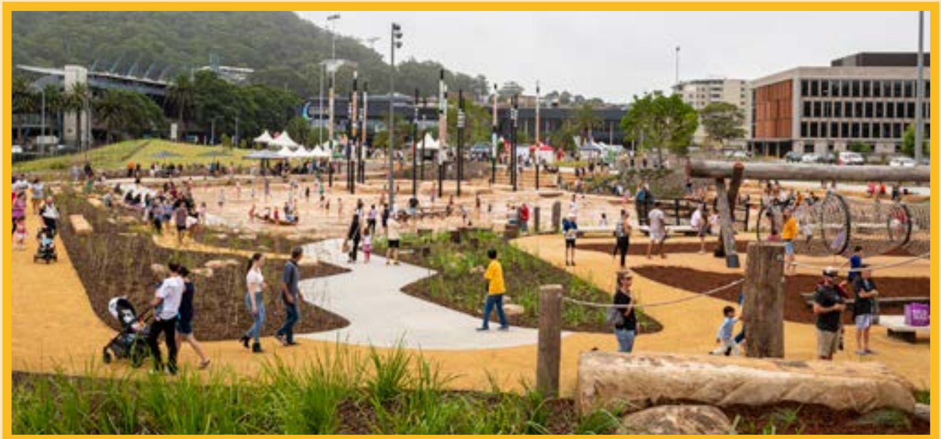
Leagues Club Park, Gosford.

Public space is flexible and responds to its environment to meet the needs of its community.