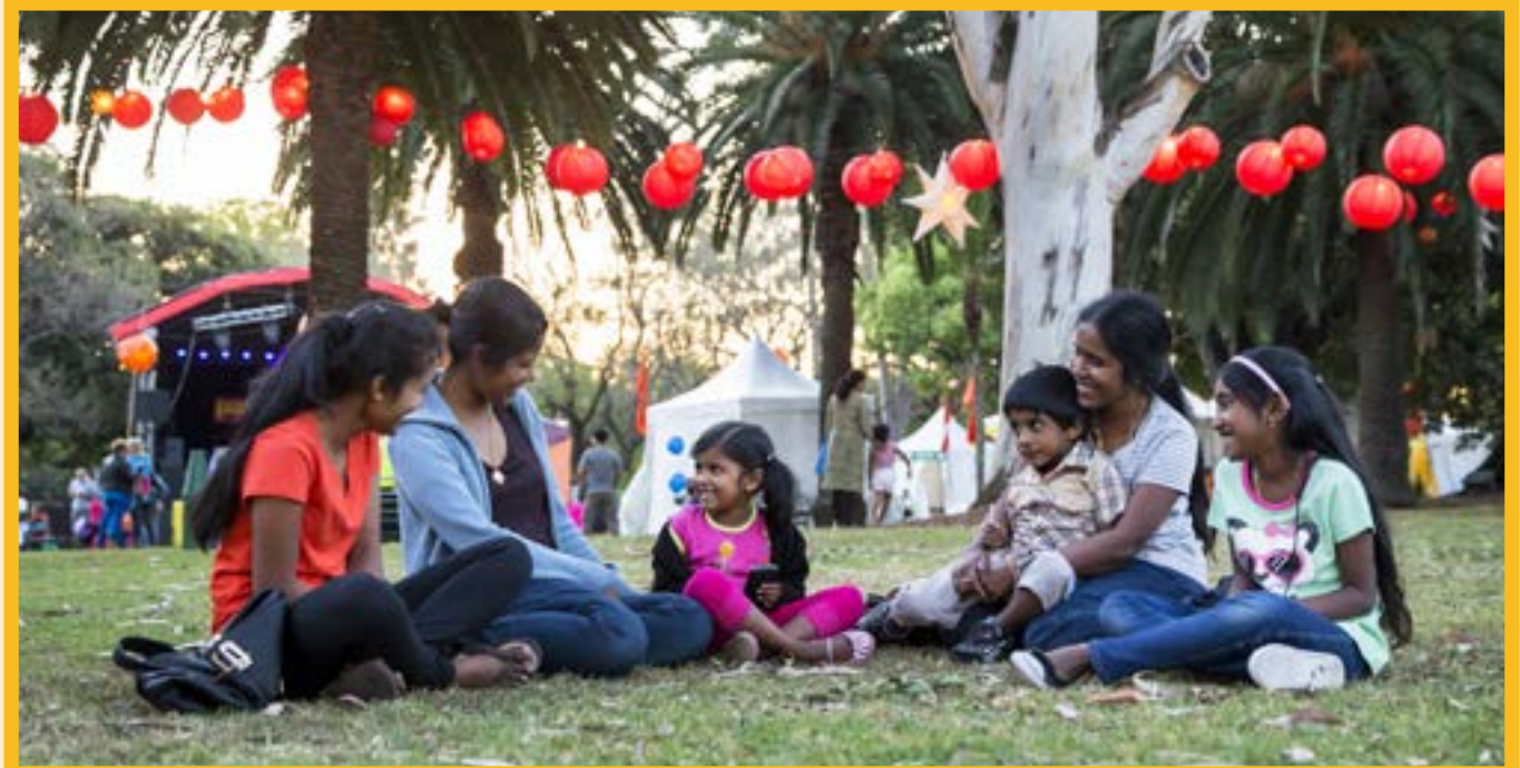
Prince Alfred Square, Parramatta.

Everyone can access public space and feel welcome, respected and included.