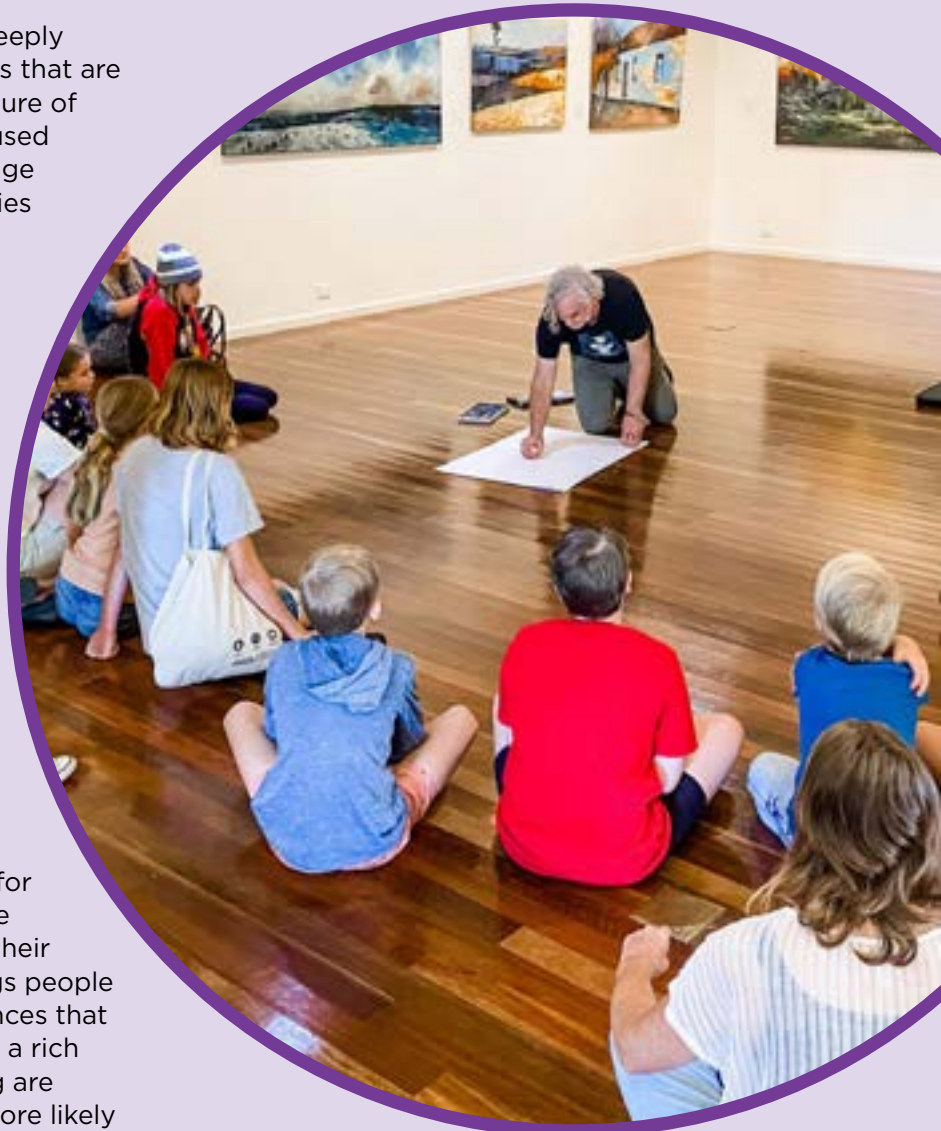
Manning Regional Art Gallery, Taree.

The rich cultural diversity of NSW brings an exciting energy into our public spaces, making them places of cultural interaction and exchange. Programming and events such as concerts, festivals, storytelling, and ceremonies can reflect local histories, cultures and traditions. They can foster social inclusion and intercultural dialogue among diverse communities.