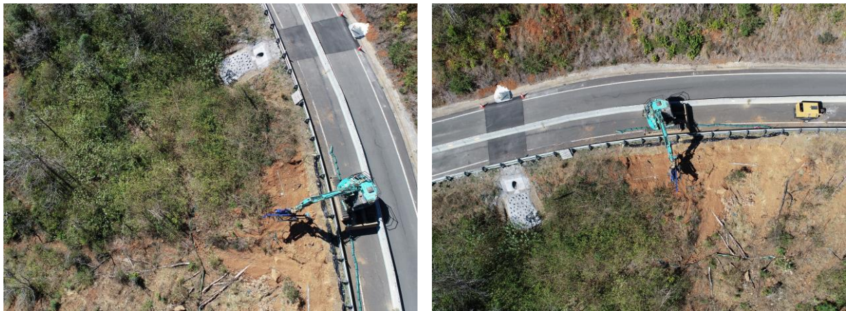
Soil nailing work underway at Slip 5 and 6

Our work hours are from 7am to 5pm, Monday to Saturday. No work is scheduled to be carried out on Sundays or public holidays.