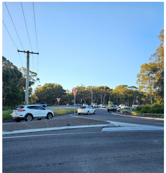
Pictured: Intersection of Mandalong Road and Freemans Drive.

The upgrade will also look at opportunities to improve public transport services and connections to Morisset Train Station as well as upgrading active transport (walking and cycling) links along Mandalong Road. These improvements will help provide options that support a shift to more sustainable modes of transport.