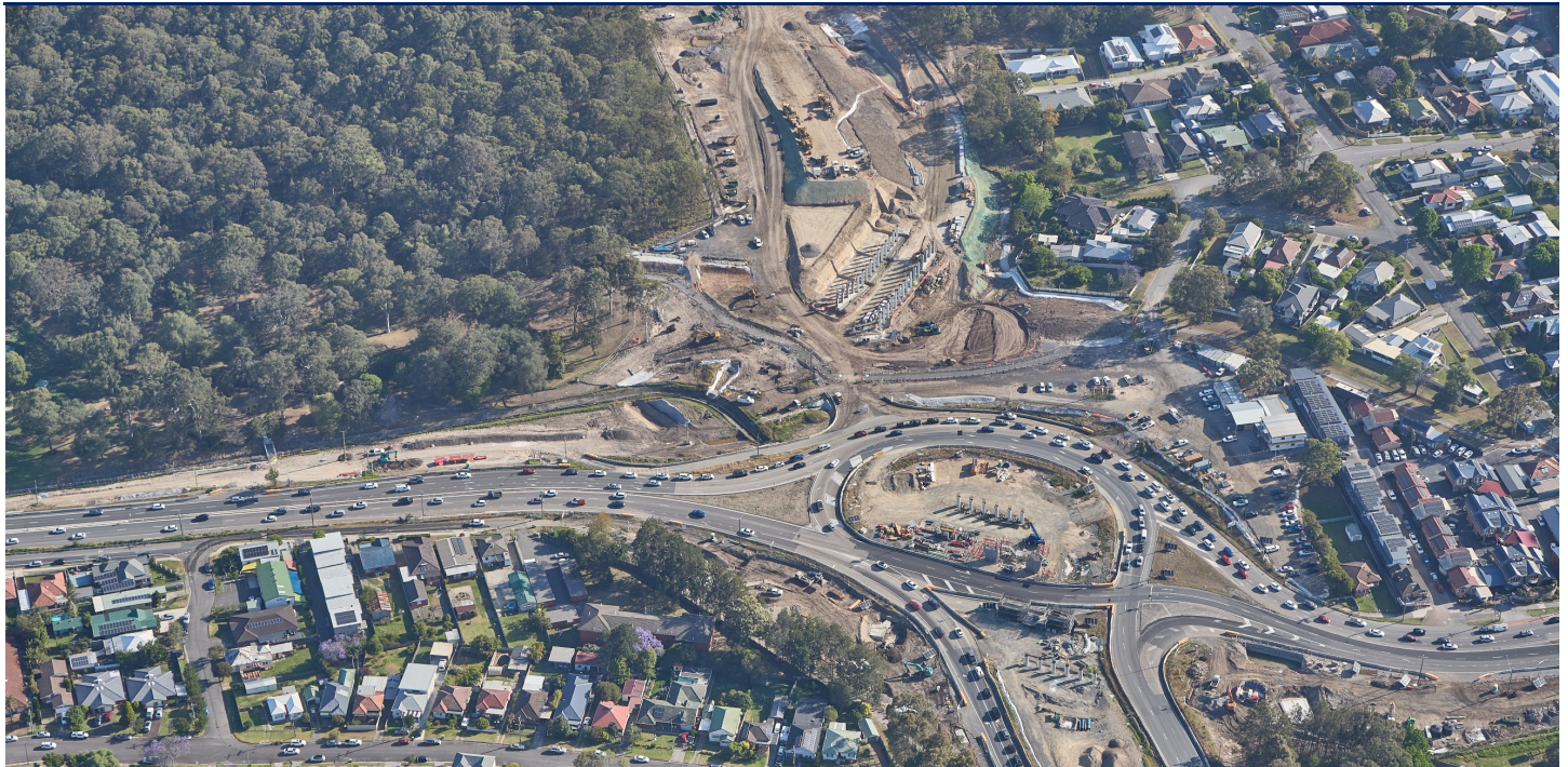
Aerial view of work underway at Jesmond roundabout (October 2023)

The Australian and NSW governments are funding the Rankin Park to Jesmond section of the Newcastle Inner City Bypass.