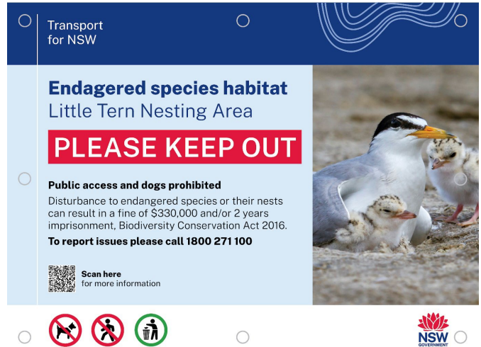
Image 2 Signage on site

You can report any issues on 1800 271 100 .