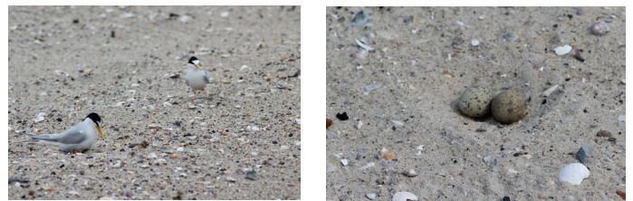
Image 3 Little Terns and their eggs