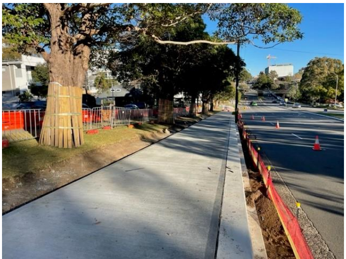
Above: Images of active transport link construction near Miranda Road and Jackson Avenue, July 2023