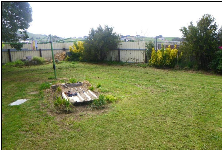
Photo 2: Backyard of FMSC showing grassed area, some small piles of stokcpiles and clothesline.