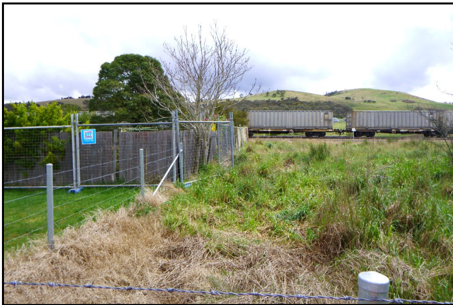
Photo 10: Site adjacent to FSMC showing temporary fencing around the site and the railway line behind the site.