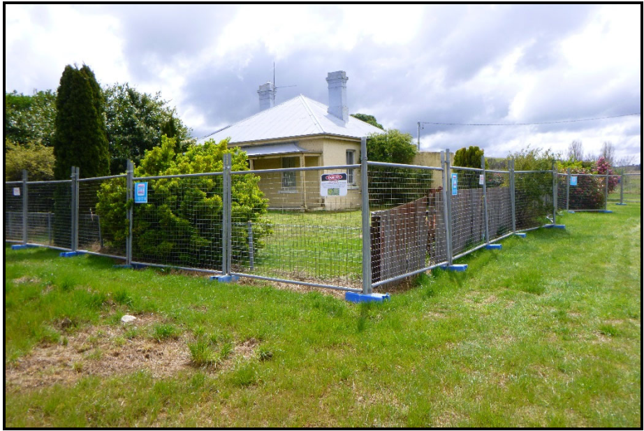
Photo 8: Front of FSMC site showing the site is fenced off with temporary fencing.