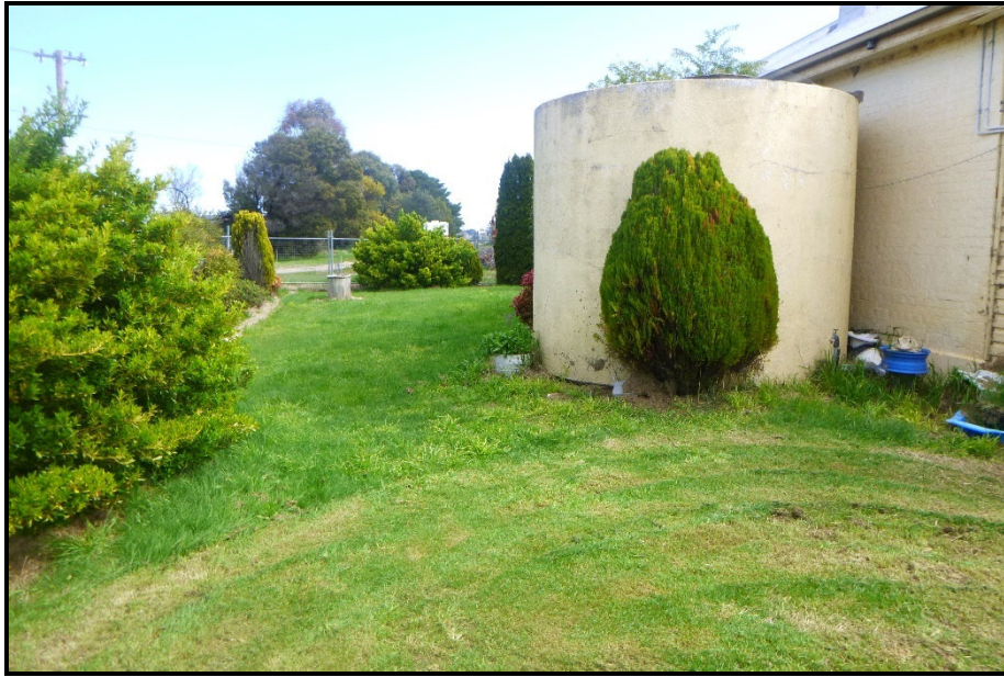
Photo 3: Side of FSMC showing grassed area, shrubs and rainwater tank.