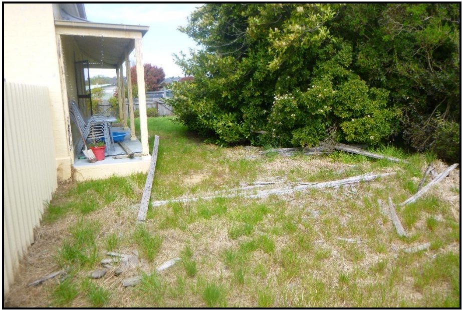
Photo 5: Side of FMSC showing sparse grass, timber pieces, large tree and porch of FMSC.