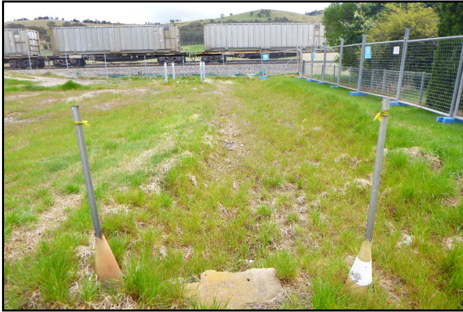
Photo 9: Site adjacent to FSMC showing temporary fencing around the site and the railway line behind the site.