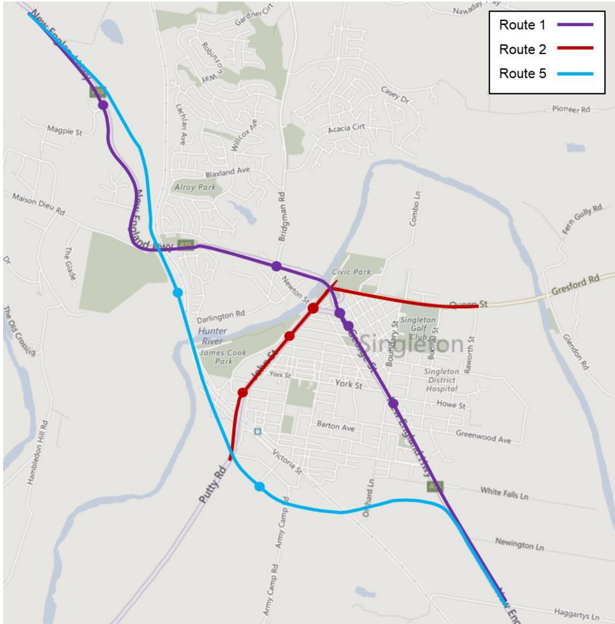
Figure 1-4 Travel Time Routes

Three travel time routes were assessed during the modelling of the bypass scenarios. The routes are shown in Figure 1-4.