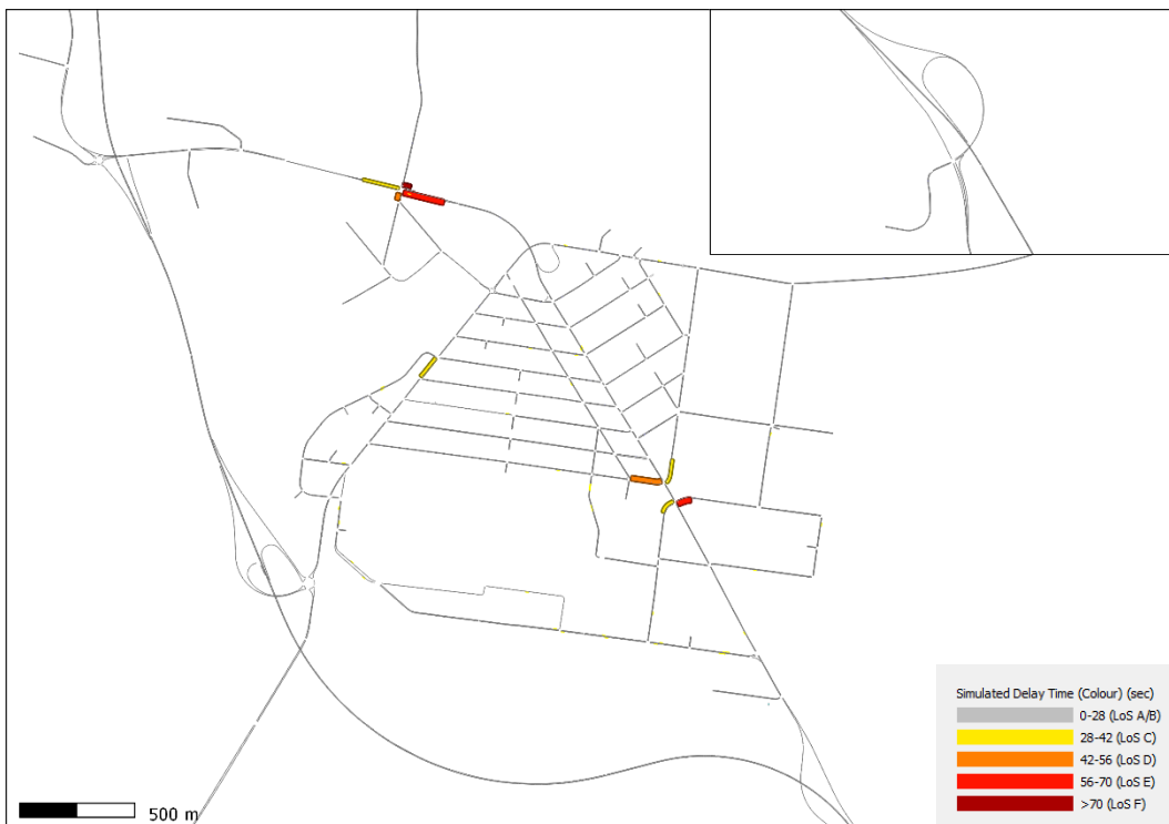
2026 Bypass AIMSUN Delay Plot PM Peak (16.00 – 17.00)