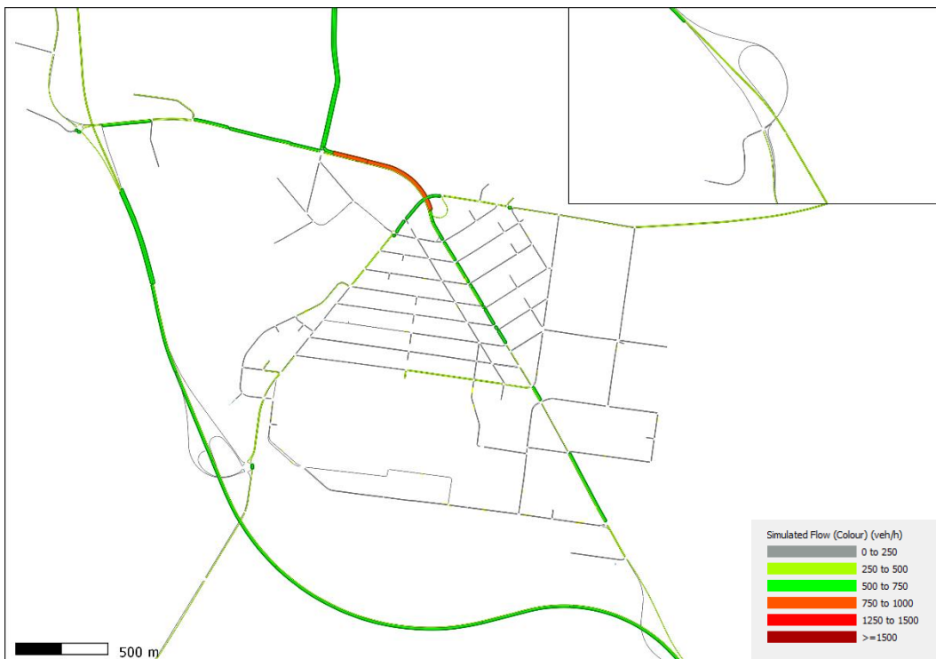
2026 Bypass AIMSUN Network Flows AM Peak (8.30 – 9.30)