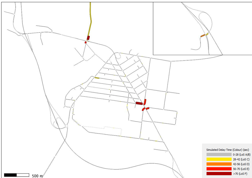
2026 Bypass AIMSUN Delay Plots AM Peak (5.30 – 6.30)