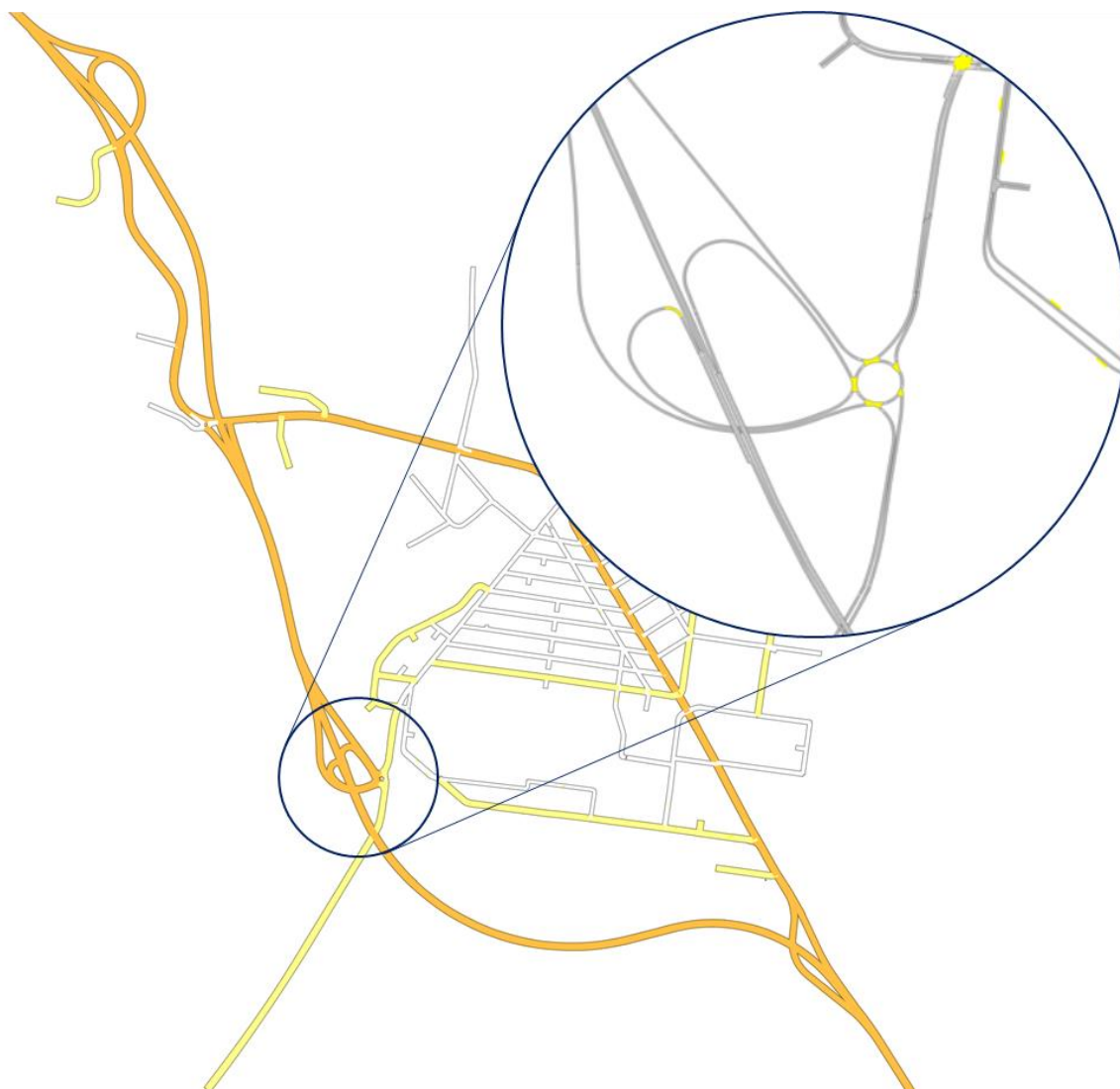
Figure 1-1 Singleton Bypass Alignment with roundabout interchange at Putty Road

Following the community consultation, an announcement was made by the Deputy Premier (16 April 2021) committing to providing a full interchange at Putty Road to make it easier to access Singleton town centre from the bypass. This additional option to be assessed was a new connection of the bypass with Putty Road and the connection would provide access to and from both the northbound and southbound lanes of the bypass from the western side of Putty Road, with an interchange connecting to Putty Road by a roundabout. Figure 1-1 below illustrates the network changes with an inset showing a closer view of the layout of the Putty Road interchange. The layout was assessed for the assumed opening year of 2026, and future years of 2036, and 2046 and compared against the modelling results of the previous bypass layout shown in Figure 1-2.