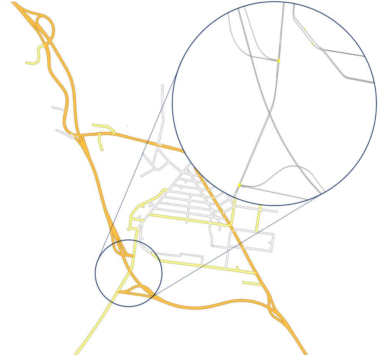
Figure 1-2 Singleton Bypass Alignment with south facing ramps at Putty Road

Previous modelling results, as outlined in Section 6 of the report, indicate that the flows on the south facing ramps at Putty Road would be limited and will only serve a relatively small number of trips e.g. trips from the New England Highway (south) to the John Street shopping precinct during the peak periods.