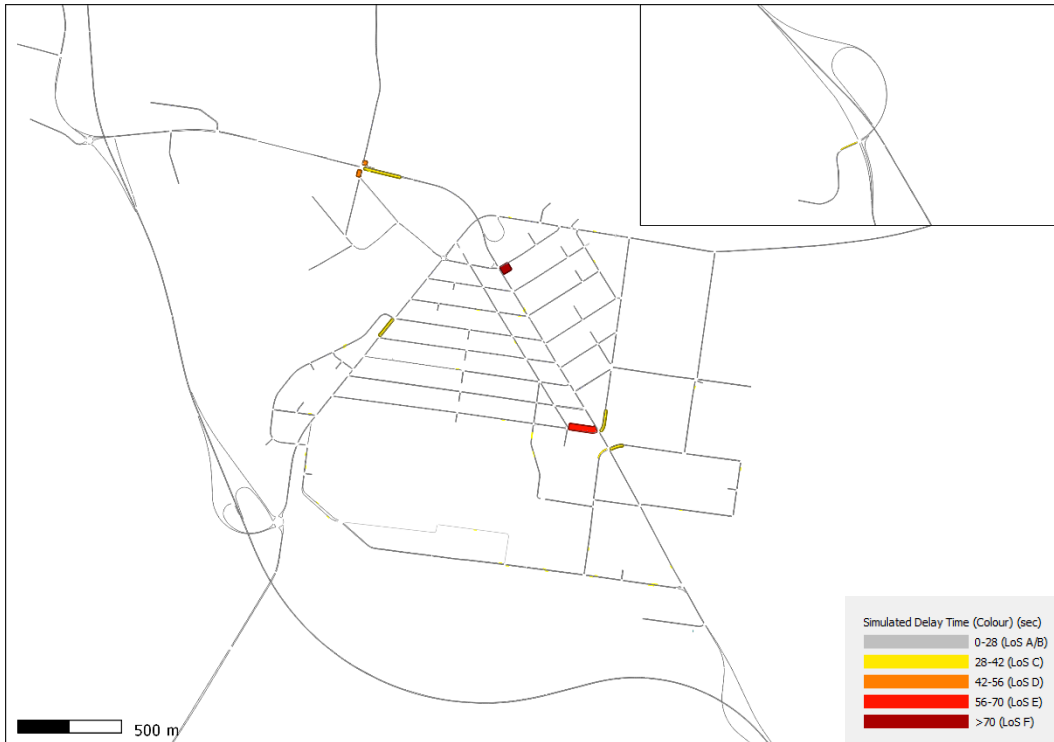
2026 Bypass AIMSUN Delay Plots AM Peak (8.30 – 9.30)