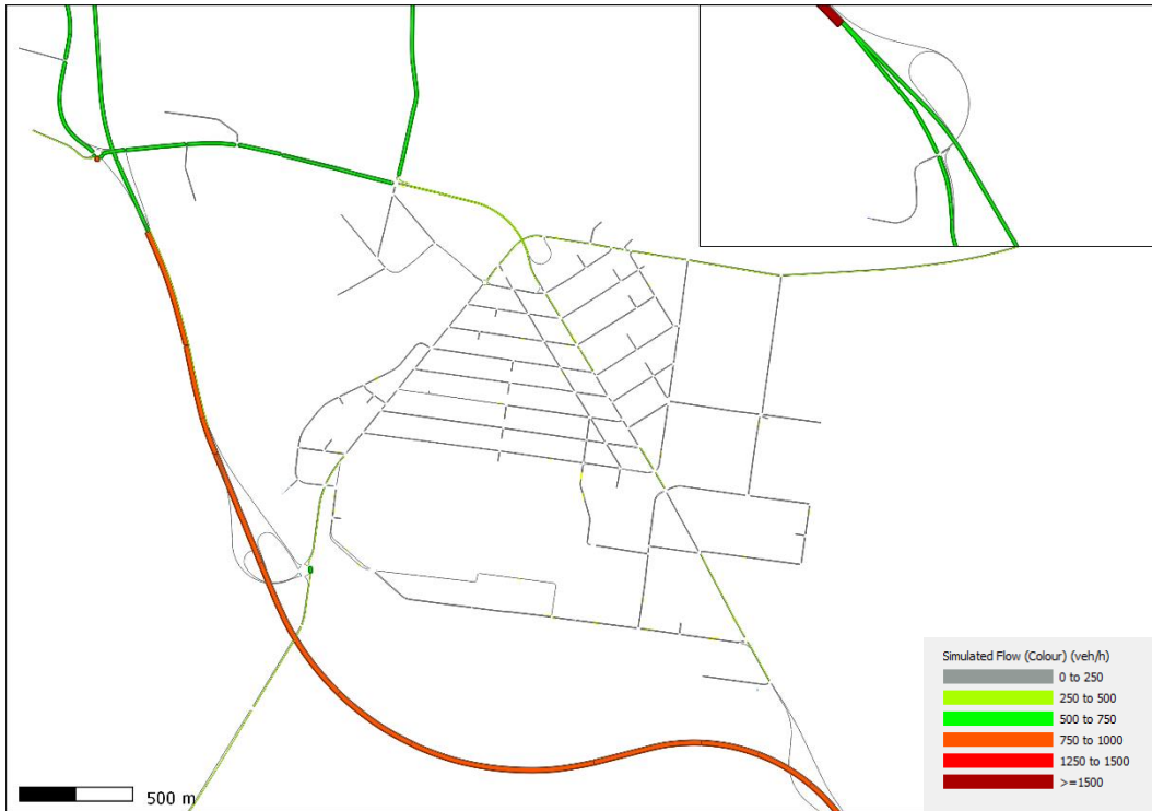
2036 Bypass AIMSUN Network Flows AM Peak (5.30 – 6.30)