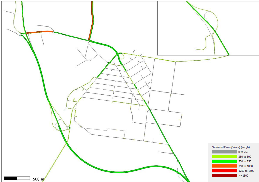
2026 Bypass AIMSUN Network Flows PM Peak (16.00 – 17.00)