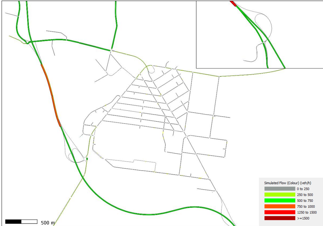
2026 Bypass AIMSUN Network Flows AM Peak (5.30 – 6.30)