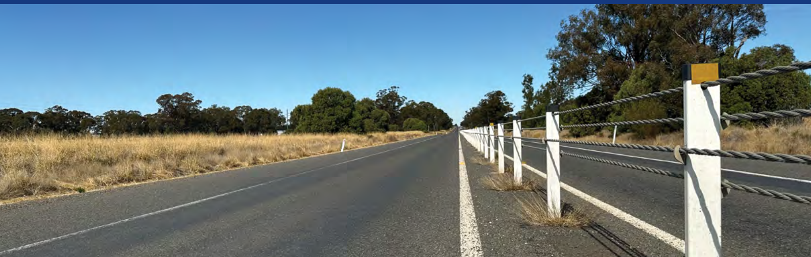
Wire rope barrier on the Kamilaroi Highway near Turrawan

The NSW Government is funding $26.4 million to boost safety on the Kamilaroi Highway between Baan Baa and Turrawan as part of the Saving Lives on Country Roads program.