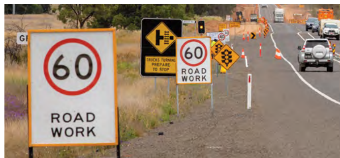
Road work on Kamilaroi Highway

Please keep to speed limits and follow the direction of traffic controllers and signs. For the latest traffic updates, you can call 132 701 , visit livetraffic.com or download the Live Traffic NSW App.