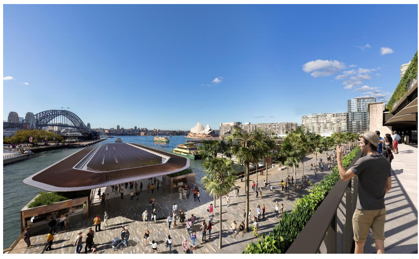
artist impression only

Transport for NSW acknowledges the Gadigal people of the Eora Nation as the Traditional Custodians of the lands on which we work and pays respect to Elders past and present.