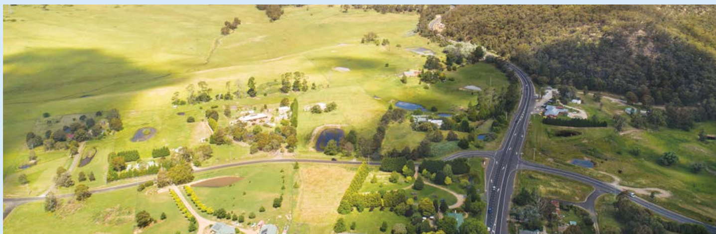
The existing Coxs River Road intersection, looking to the east towards Mount Victoria