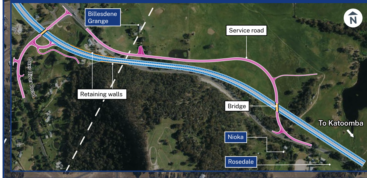
Concept design indicative only, final layout to be determined through detailed design.