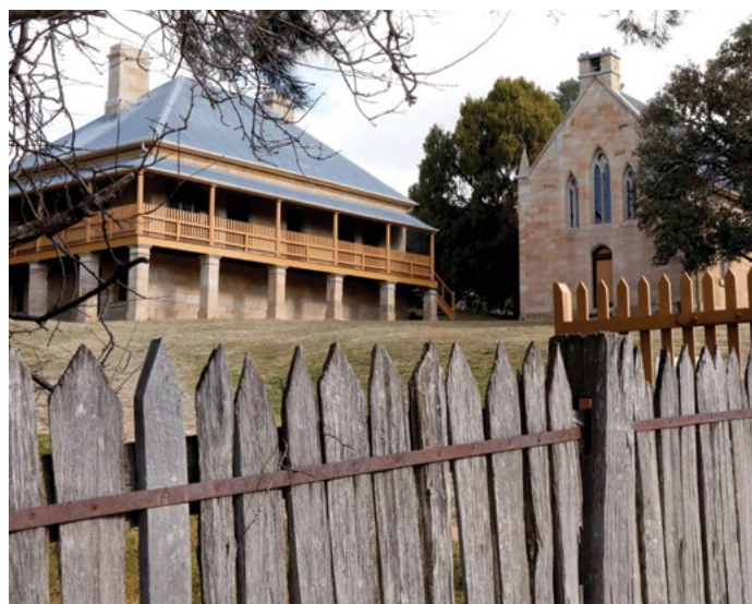
Heritage buildings at Hartley Historic Village

We also held two face-to-face consultation sessions for the wider Aboriginal community in May, where we asked for ideas for cultural interpretation initiatives for the Great Western Highway Upgrade Program. We are exploring all suggestions for potential inclusion into the urban design of the upgrade.