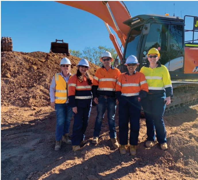
Local and regional people and businesses will have a unique opportunity to reap the benefits of nearly a decade of construction

Find out more at nswroads.work/gwhindustry