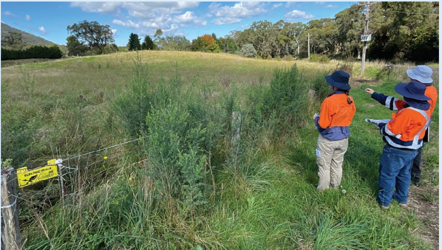
The seed collection team onsite near Coxs River Road

We will hold further meetings with the community as the urban design and cultural interpretation planning progresses.