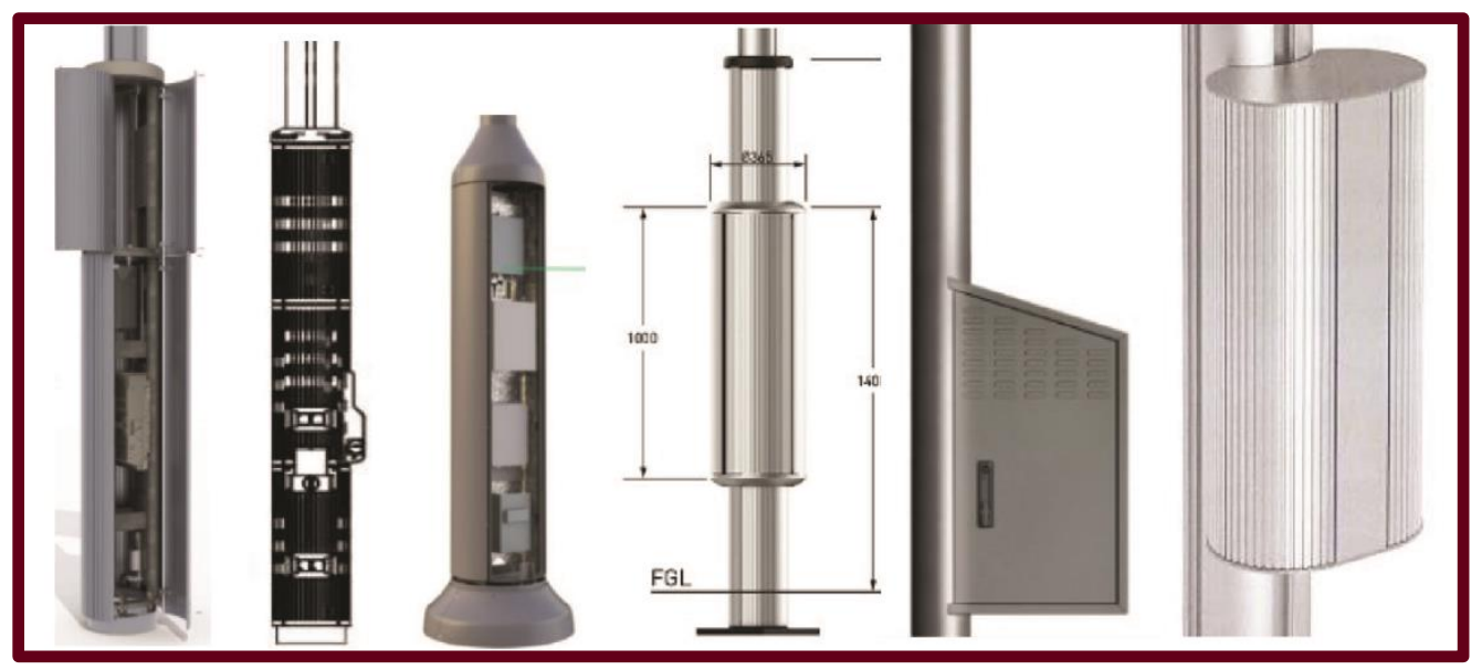
Figure 2 examples for small cell housing

However, small cells may not always be appropriate. Consideration should be given to physical limitations, such as space and heating effects, and electromagnetic energy cumulative emissions of multiple cells being the equivalent of a larger mobile facility. Examples of small cell housing on MFPs are shown in Figure 2.