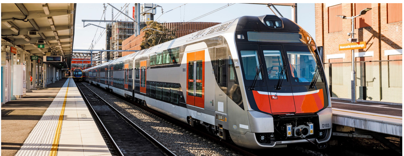
External view of new intercity Mariyung fleet

From 1 April 2022 , COVID-19 construction hours will end, and standard construction hours will revert back to 7am-6pm Monday to Friday and 8am-1pm on Saturdays .