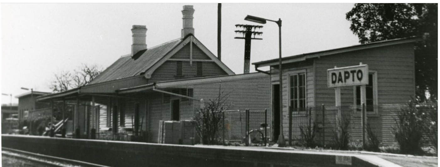
Image of Dapto Station sourced from the Wollongong City Library, date unknown.