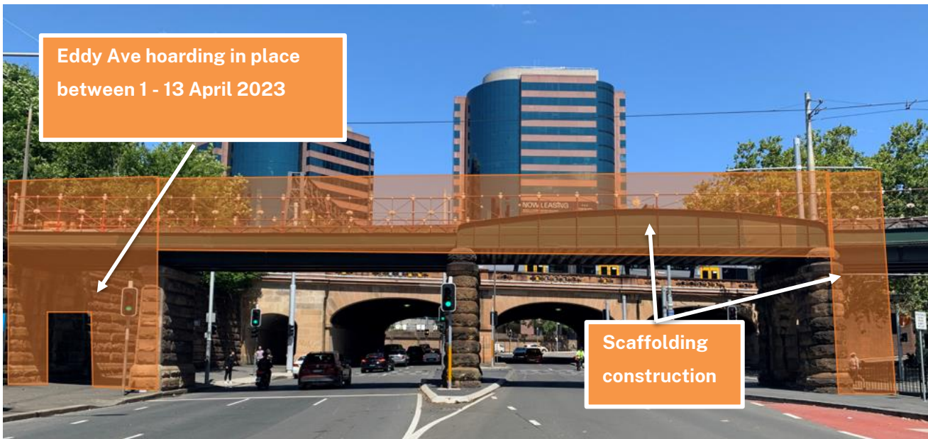
Figure 2: Location where hoarding and scaffolding will be in place during works