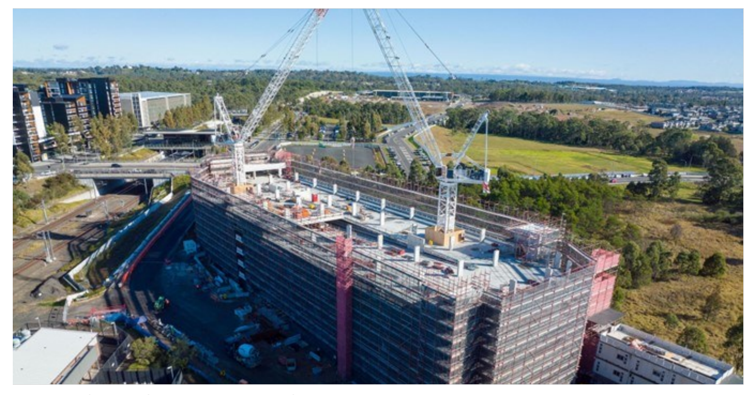
Progress photo of the commuter car park