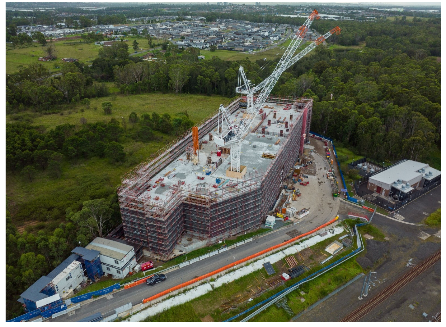
Construction progress on the Edmondson Park North Commuter Car Park