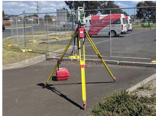
Left image: example of surveying equipment.

If you have questions, or concerns, about the work, would like more information about the project or would like to receive project updates by being added to our mailing list, please call 1800 979 577 (during business hours) or email parramatta@transport.nsw.gov.au