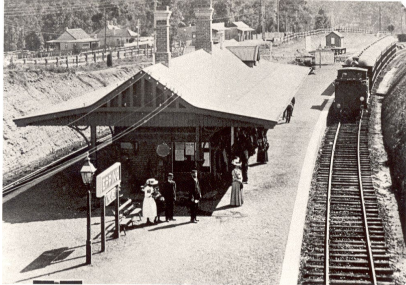
Above: Epping Station in 1910

Epping Station was first opened in 1896 and was initially named 'Field of Mars'. You can see an early picture of the station adjacent.