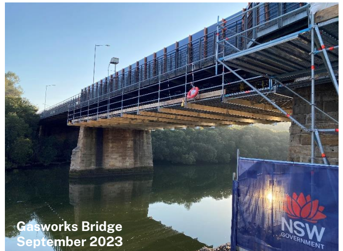
Gasworks Bridge September 2023

In addition to the above, we will temporarily close Gasworks Bridge to all traffic (including pedestrians