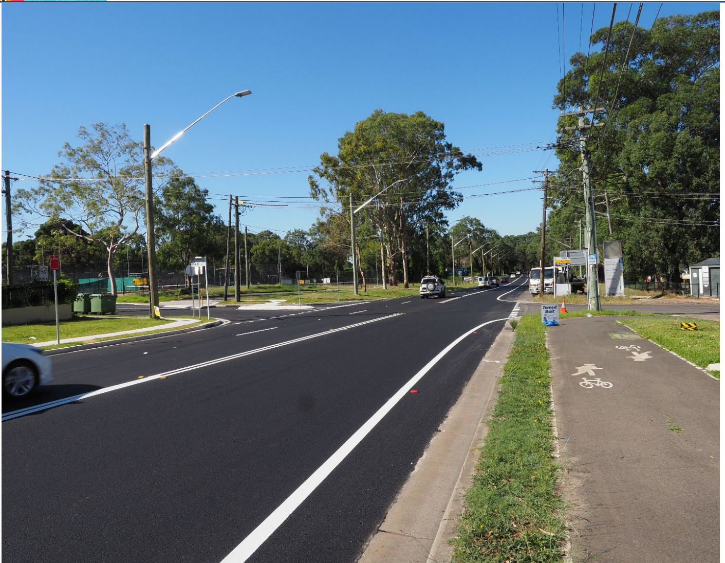
The intersection of Henry Lawson Drive and Rabaul Road