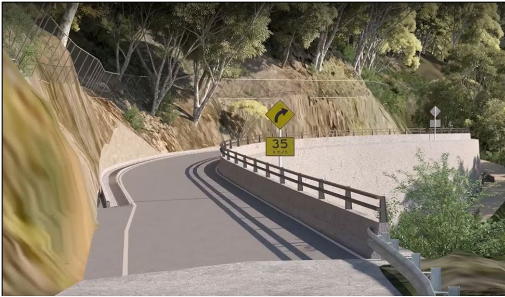
Artist impression of the Five Mile design