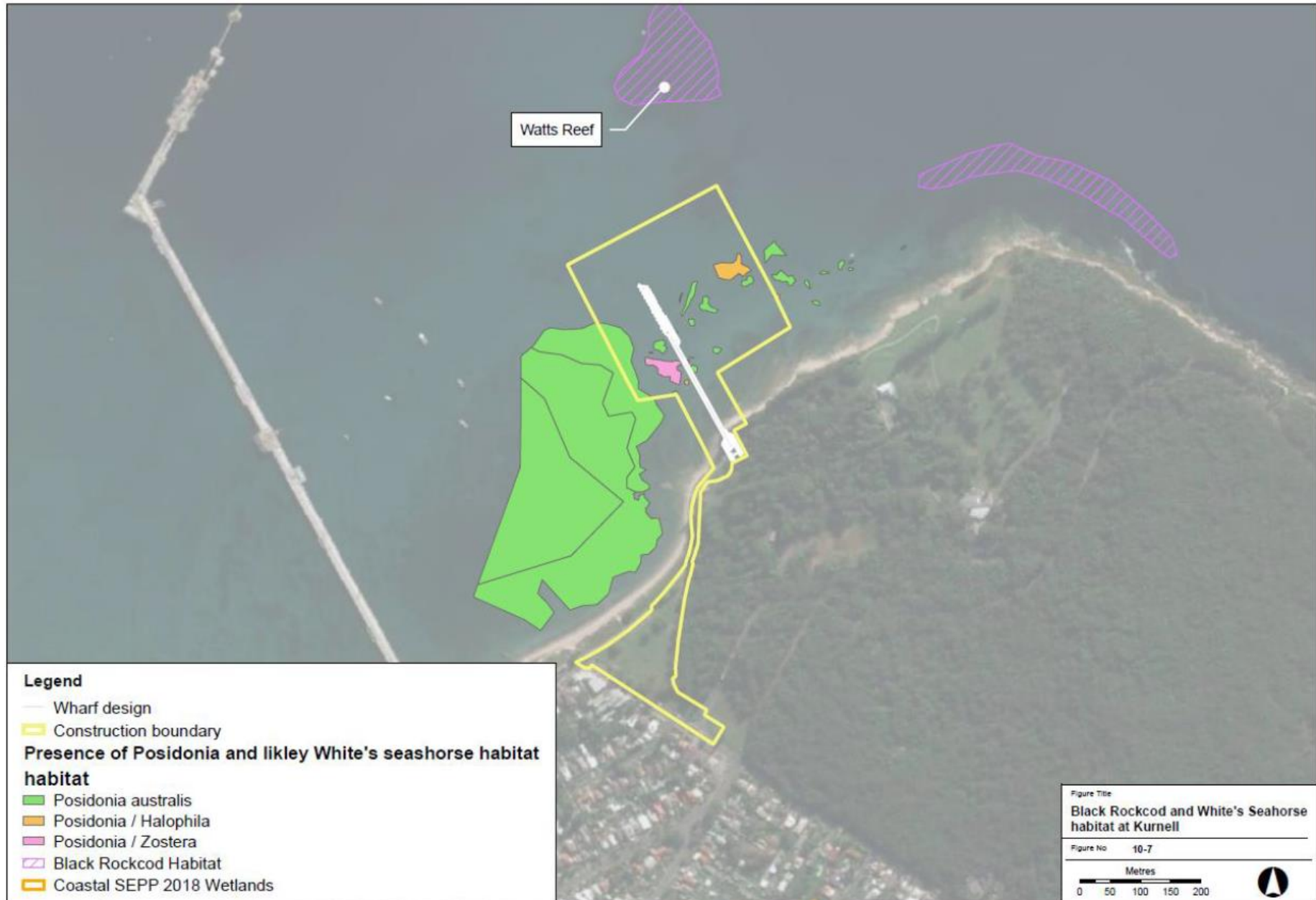
Figure 10-7: Black Rockcod and White's Seahorse habitat at Kurnell