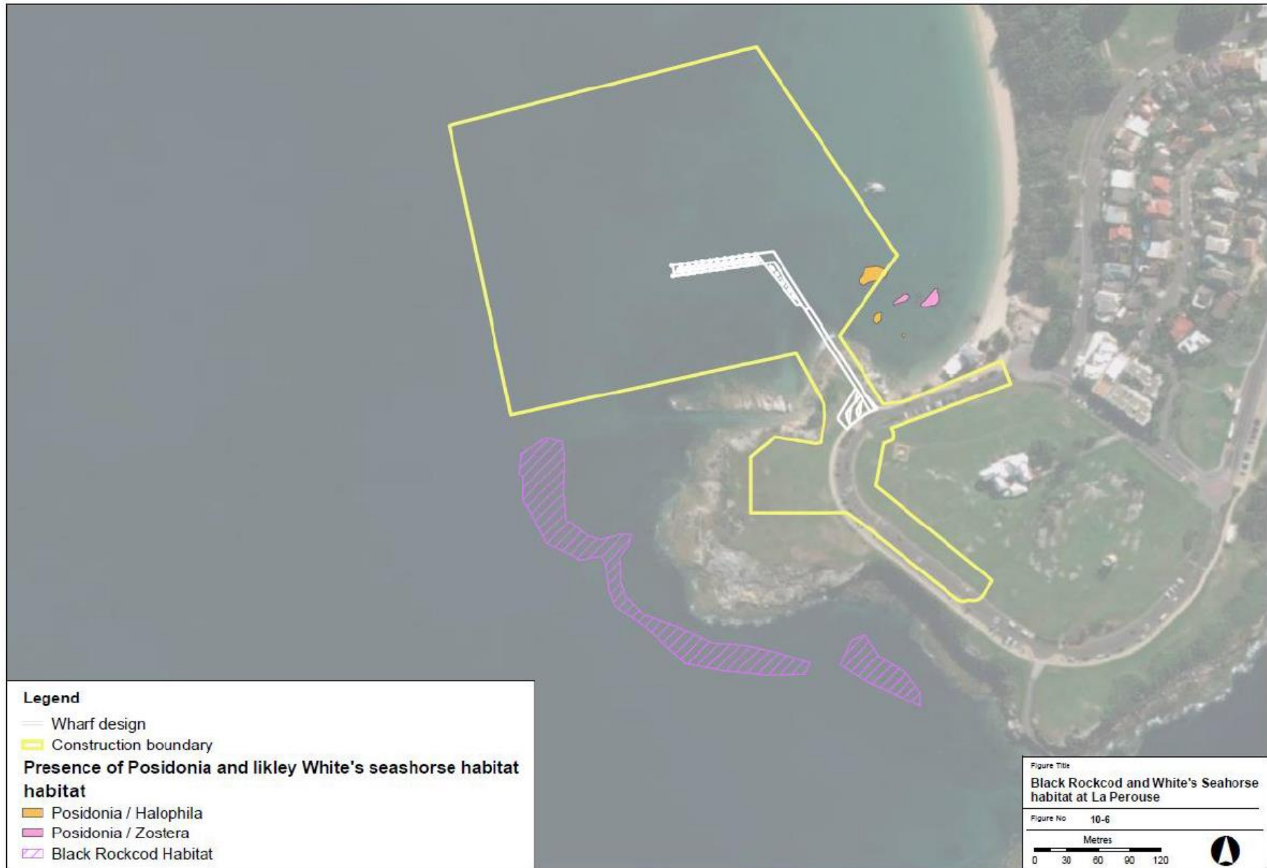
Figure 10-6: Black Rockcod and White's Seahorse habitat at La Perouse