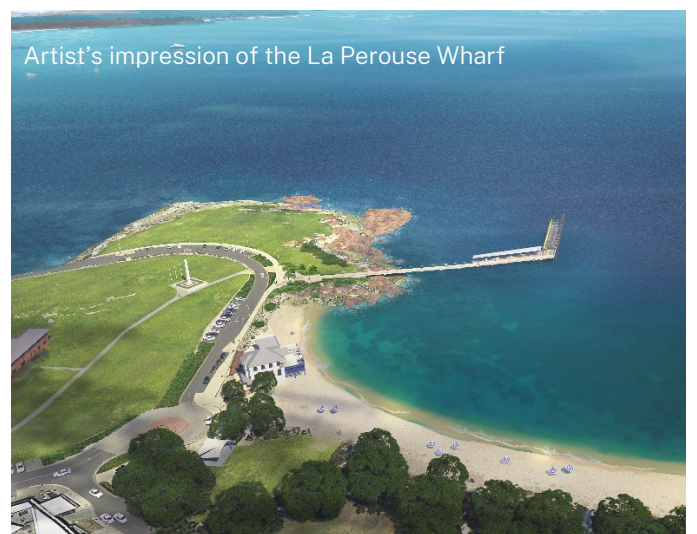
Artist's impression of the La Perouse Wharf

All of these activities will be low impact and take place during the day.