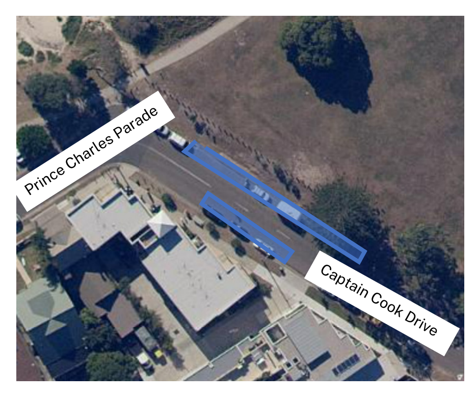
Image showing approximate area of car parking spaces that will be temporarily removed for up to five days while we carry out utilities work on Captain Cook Drive.

Marine Mammal Observers will keep an eye out for marine mammals during piling work and stop work if any come close to the work zone.