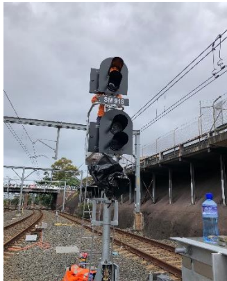
Example of a rail traffic signal