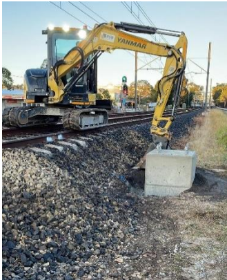
Example of a new concrete footing

We will also install a new rail traffic signal and carry out excavation work near Newtown Station.