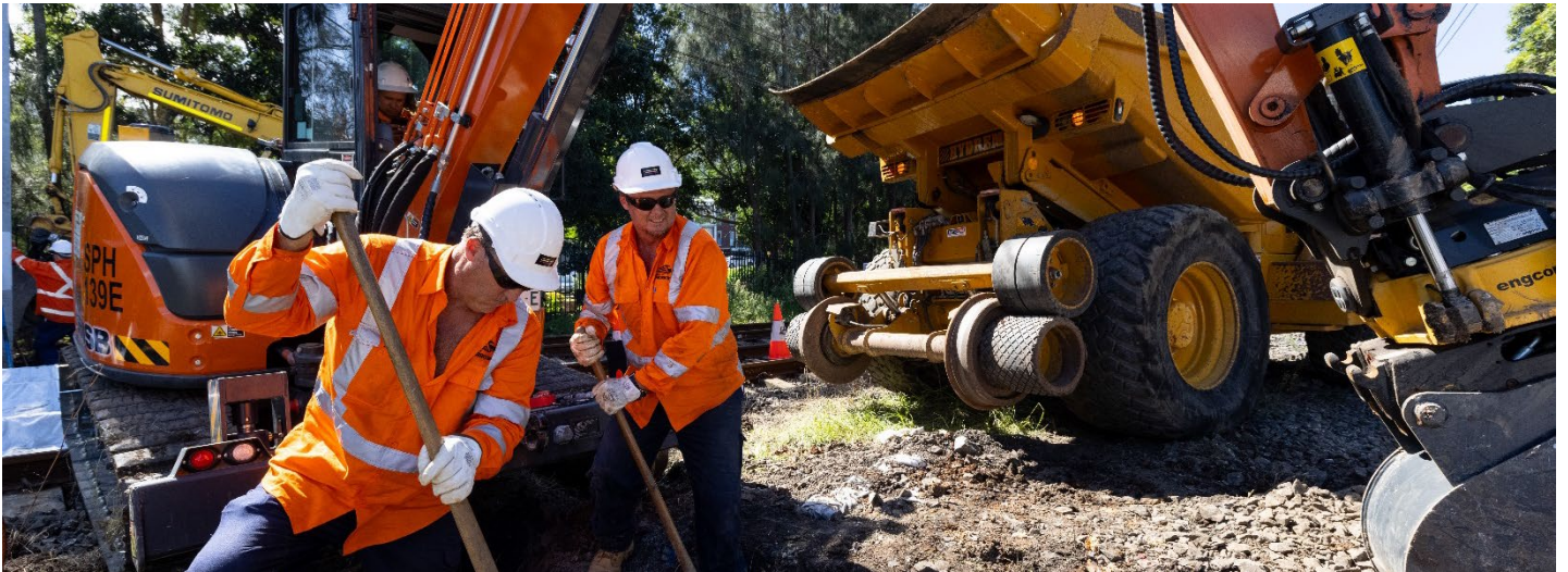
More Trains, More Services' construction team members at work in the rail corridor on the NSW South Coast in 2021