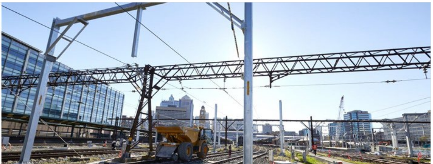
Work undertaken in June 2021 for the Sydney Terminal Reconfiguration Project at Central

Work is dependent on weather, site conditions and others factors and is subject to change.