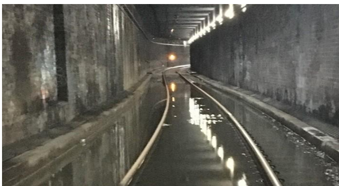
Flooding event in the Illawarra Dive tunnels at Eveleigh. Work is underway to improve drainage system in the area and prevent future flooding in the rail corridor.

From Monday 27 June , we will start construction of a 50 centimetre high retaining wall near the Paint Shop (located next to Carriageworks) that will divert excessive rainwater from flowing into the rail corridor. The water retained by the wall will feed into a new drainage pipe that will be installed and connected to the existing drainage system in the area. This work will take up to four months to complete and will be carried out during standard construction hours.