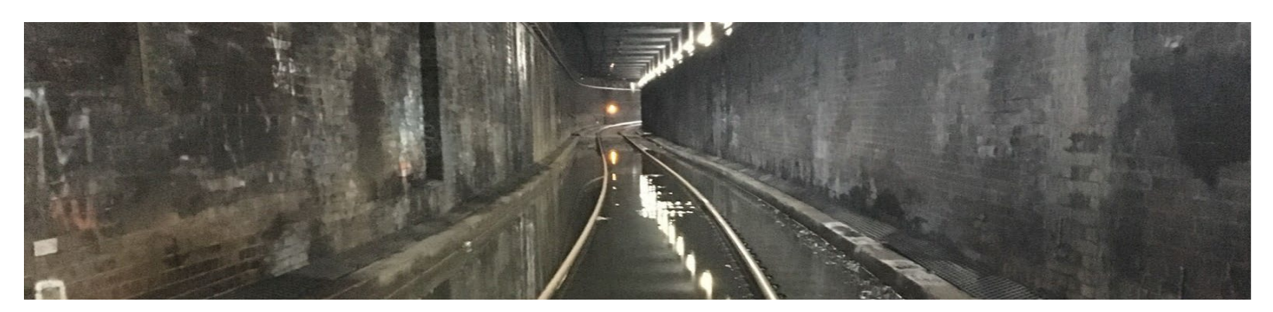
Drainage upgrade work will prevent future flooding inside train tunnels in Eveleigh

Some work will take place outside of these hours as detailed overleaf. Scheduling work during trackwork periods when no trains will be running enables our project team to complete essential activities safely.