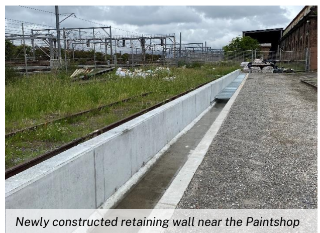
Newly constructed retaining wall near the Paintshop