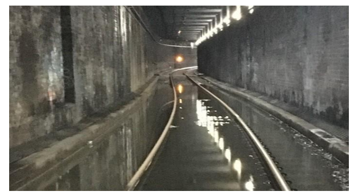
Flooding event in the Illawarra Dive tunnels at Eveleigh. Work is underway to improve the drainage system in the area and prevent future flooding in the rail corridor.

The majority of deliveries will be scheduled during the day, however some deliveries will be required at night during trackwork periods.