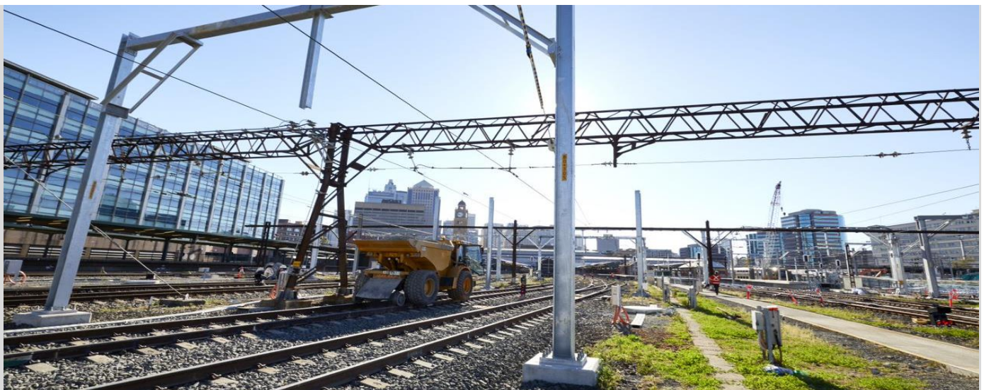
Work undertaken at Central in 2021 as part of the Sydney Terminal Area Reconfiguration Project

All work is dependent on weather and site conditions and is subject to change.