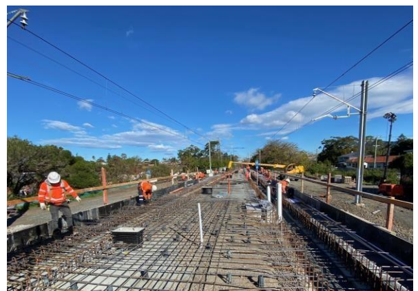
A picture showing the steel reinforcement of the platform extension at Bellambi prior to the concrete pour – August 2021