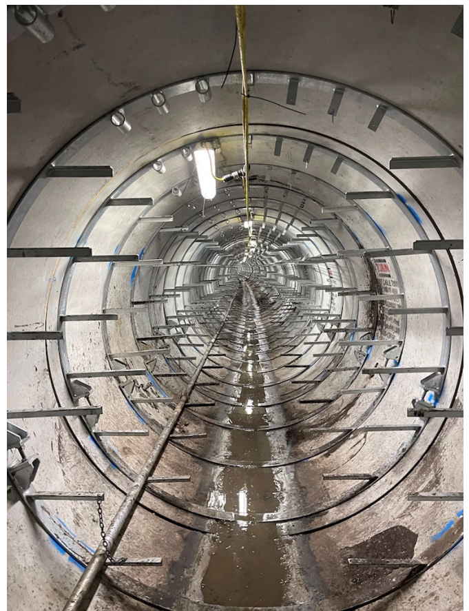
The newly excavated cable tunnel beneath Bourke Road at Mascot

The micro-tunnel boring machine (MTBM) was removed from the retrieval shaft site on Bourke Street between Coward and John Streets. This was a significant milestone for the project and allows for the power connection of the new substation at 166 O’Riordan Street to the T8 Airport Line. We would like to thank the local Mascot community for their feedback and patience while the retrieval of the MTBM was being carried out.