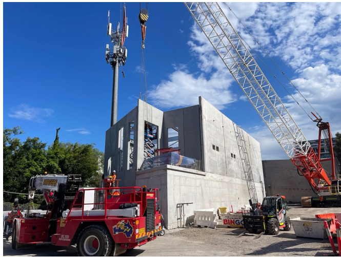
Progress on the walls of the south building at the future substation site at 166 O'Riordan Street

Works planned for the Mascot Station Access Upgrade in February include: